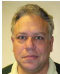
Stephen Altschul co-developed BLAST.

Stephen Altschul: BLAST was the first program to assign rigorous statistics to useful scores of local sequence alignments. Before then people had derived many different scoring systems, and it wasn't clear why any should have a particular advantage. I had made a conjecture that every scoring system that people proposed using was implicitly a log-odds scoring system with particular 'target frequencies',